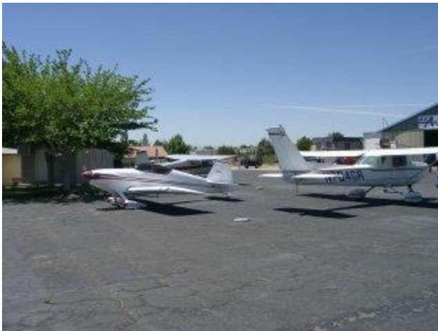
An RV-4 is parked behind a local swept tail 1976 Cessna 150. Behind the RV-4 is Scott Liefeld's new straight tail Cessna 150.