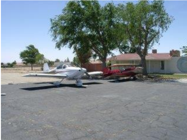
An RV-6A parked next to Rick Lipinski's Ragwing Special, a former People's Choice winner at this fly-in.

The ramp was filled with a collection homebuilts and production aircraft, with the RV series being the most prevalent homebuilt type.