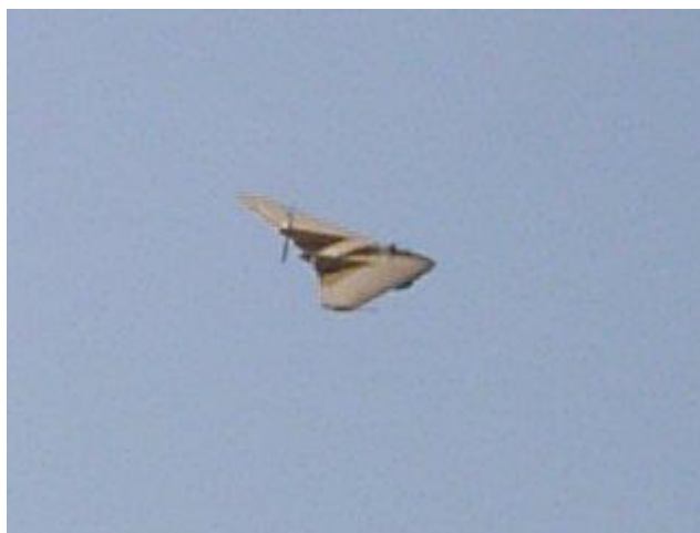
What Happens When Pilots Don't Get Enough Tail