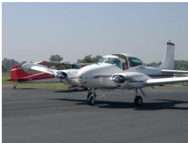
The Smiling Twin Navion Taxis By the Watchful Eyes of the PPTAF