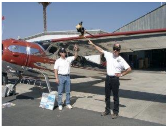
PPO Newbie Cobra Receives Project Police Pointing Training From Knife, Using the Karwacky/Bakken Pitot Tube Cover as a Subject