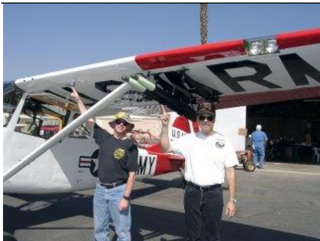
Erbman and Knife Succeed In Their Assignment To Find Long, Pointy Things On The Bird Dog