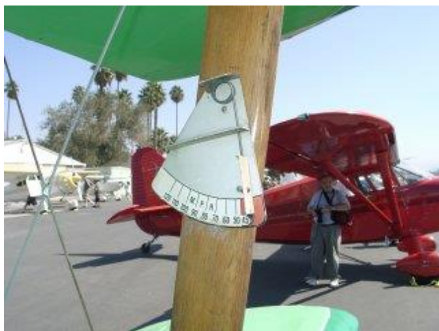
The Latest In High-Tech Airspeed Systems on a Tiger Moth