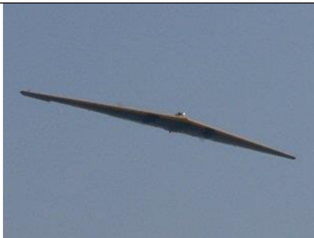
The Northrop N9M Flying Wing Mucks Up The Flabob Pattern