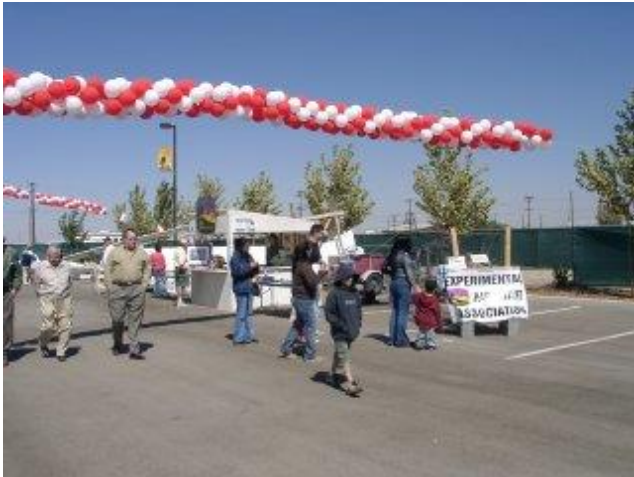
Looking North at the Project Police display area

Project Police Picture Pointer Knife invited a couple of America's Future Finest (Jr. ROTC Cadets) to come try out the Bearhawk fuselage. Of course, because they are younger and less experienced than Knife, it took two of them to create enough engine noise to manage a virtual takeoff. Multi-engine Bearhawk?