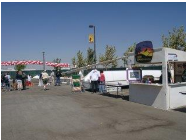
Last picture of the (in)famous Chapter 1000 booth, now proudly doing duty with the Soroptimists