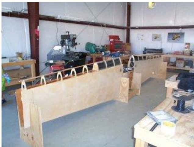
One highly stressed, composite spar, wooden aerobatic wing awaiting leading edge forming