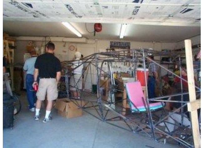
Bearhawk Fuselage In Erbman's New Shop

PPO Kevin Prosser was there with camera in hand, and has made the following pictures available to us.