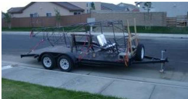
Bearhawk Fuselage On The Trailer, Ready To Go