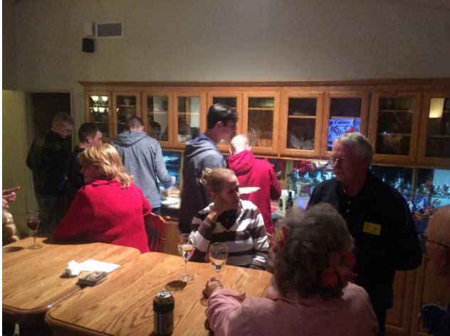
Cadets respond to the call to "Bun Up!"

Most, if not all of this is true, and yet may appear disturbingly familiar.