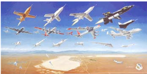
This 10 X 20 foot mural titled "The Golden Age of Flight Test" by aviation artist Mike Machat hangs inside the new museum.