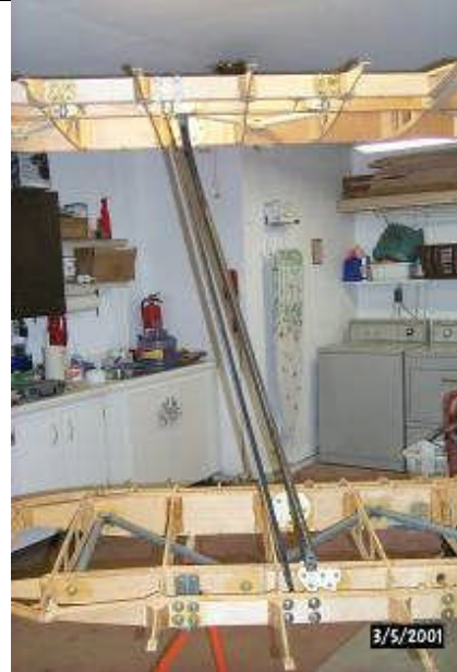
Left Upper and Lower wings, showing the I-Strut, Slave Strut, Upper and Lower ailerons, Compression tubes, aileron hangers, and aileron bellcrank.