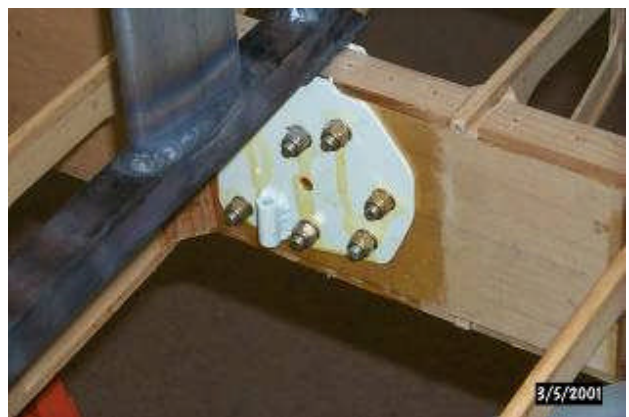
Bottom Left Wing, Front Spar, Looking forward from trailing edge of wing, I-Strut to Wing Fitting - The hole seen drilled is for the internal flying wire fittings. The bottom tube is approximately 1" long, 7/16 x 0.095, drilled and tapped for 1/4 x 28 bolt. A ring will be made with 1/4 x