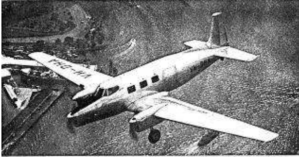
The de Havilland DHA-3 Drover Commercial Monoplane (three 140 h.p. D.H. Gipsy Major engines)

Some aircraft were later modified to use 3 x Lycoming 0-360's"