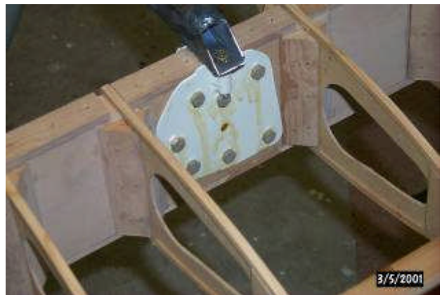
Bottom Left Wing, Front Spar, Looking aft from leading edge of wing, I-Strut to Wing Fitting - The hole seen drilled is for the internal flying wire fittings.