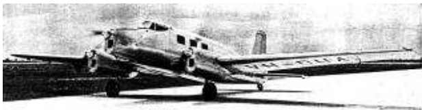
The de Havilland DHA-3 Drover Commercial Monoplane (three 140 h.p. D.H. Gipsy Major 10 engines)