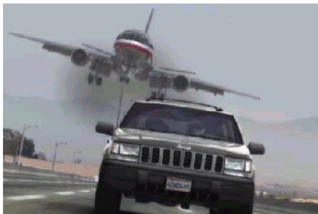
You mean this isn't runway 30?