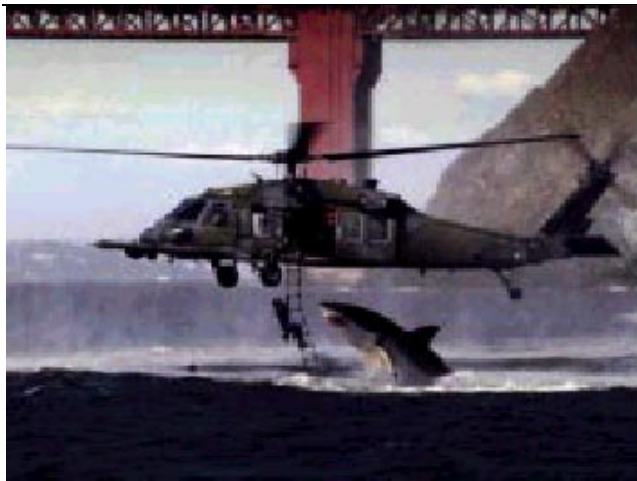
I think I'll just climb back in the aircraft