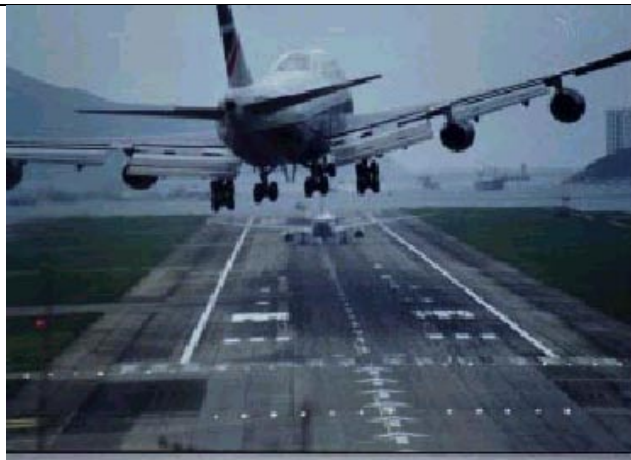
He said "cleared to land," didn't he?