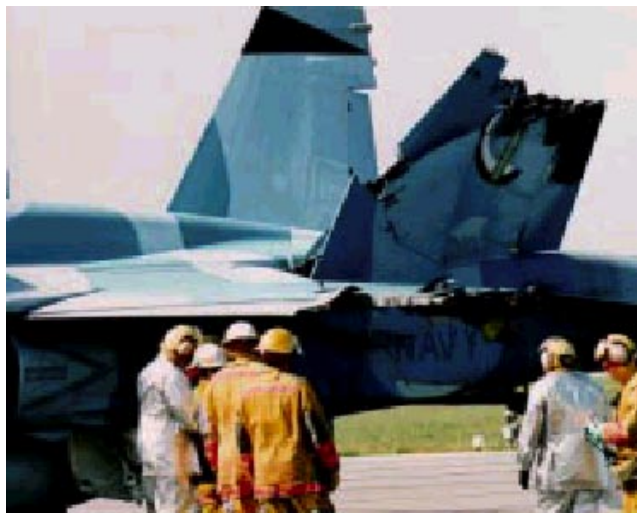
I hope they don't take this out of my pay