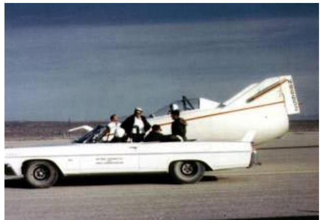
M2-F1 with the grossly over-powered tow vehicle

Starting with the tube and wood M2-F1 (a “proof-of-concept” vehicle towed behind a Pontiac convertible with a 500 HP engine specially built by Mickey Thompson, and later behind a C-47), the aluminum M2-F2 (B-52 air drop), the M2-F3 (same as M2-F2 with extra vertical fin in the middle), the HL-10 (from Langley), all under NASA control, and the USAF X-24A and X-24B projects. Wen’s posse included Joe Walker , Bruce Peterson (who later starred in the opening of the TV show “6 Million Dollar Man”), and Bill Dana (who spent the ‘60s being confused with a stand-up comedian of the same name posing as Jose Jimenez , the reluctant astronaut).