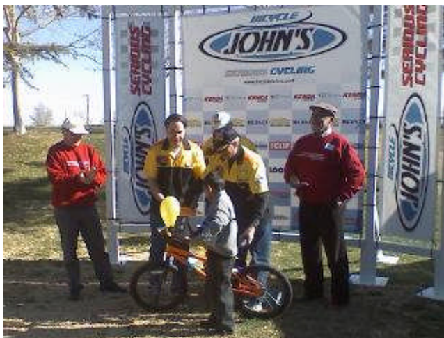
After FAA inspection and the 40 hour fly-off, the bike is presented to a possible future Project Police Officer