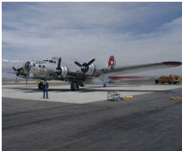
Fly Safe and Check 6!

Finally, mark March 31-April 2 on your calendars as the "Aluminum Overcast" returns once more to Fox Airfield. We will be hosting the B-17 aircraft and crew while they provide rides to local aviation buffs. This is always a good time, low-effort, and profitable for the chapter and I urge you to say "Yes!" when the chapter coordinator contacts you for support.